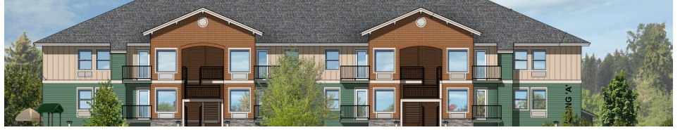
Kulshan View Phase I Breaking ground in 2026

Kulshan Vista Village is a partnership with Mount Vernon School District, and a strategic investment in housing stability for families with school-aged children. In Skagit County, housing instability remains one of the most significant barriers to educational success and long-term economic mobility. Families earning low wages, farmworker households, and those facing unexpected hardship often struggle to secure stable, affordable rental housing. When housing is unstable, students experience disruptions in attendance, academic performance, and connection to their school community.